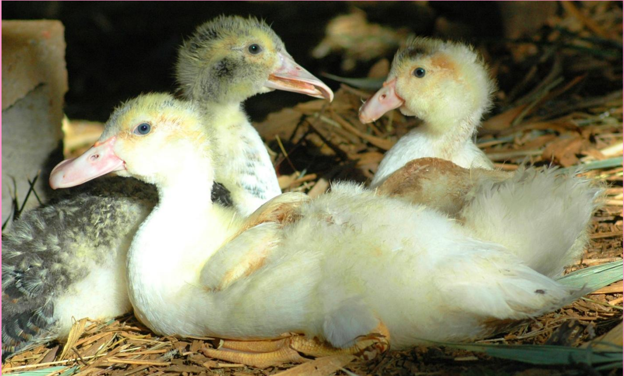
These sweet Muscovy ducklings were born with deformed bills as a result of inbreeding at a duck farm.

Muscovy Ducks - The average life span of domestic Muscovy ducks is 8-12 years of age. A long-tailed, tropical perching duck, the Muscovy is native to Mexico and Central America and South America. Unlike other breeds of ducks who vocalize with noisy quacks, Muscovy ducks make quiet hissing sounds. Newly hatched chicks stay close to their mothers for about 10–12 weeks, especially at night, as their bodies cannot produce all the heat they need. Often, the drake (father) will stay in close contact with the brood, walking with them during their travels in search for food and providing protection.