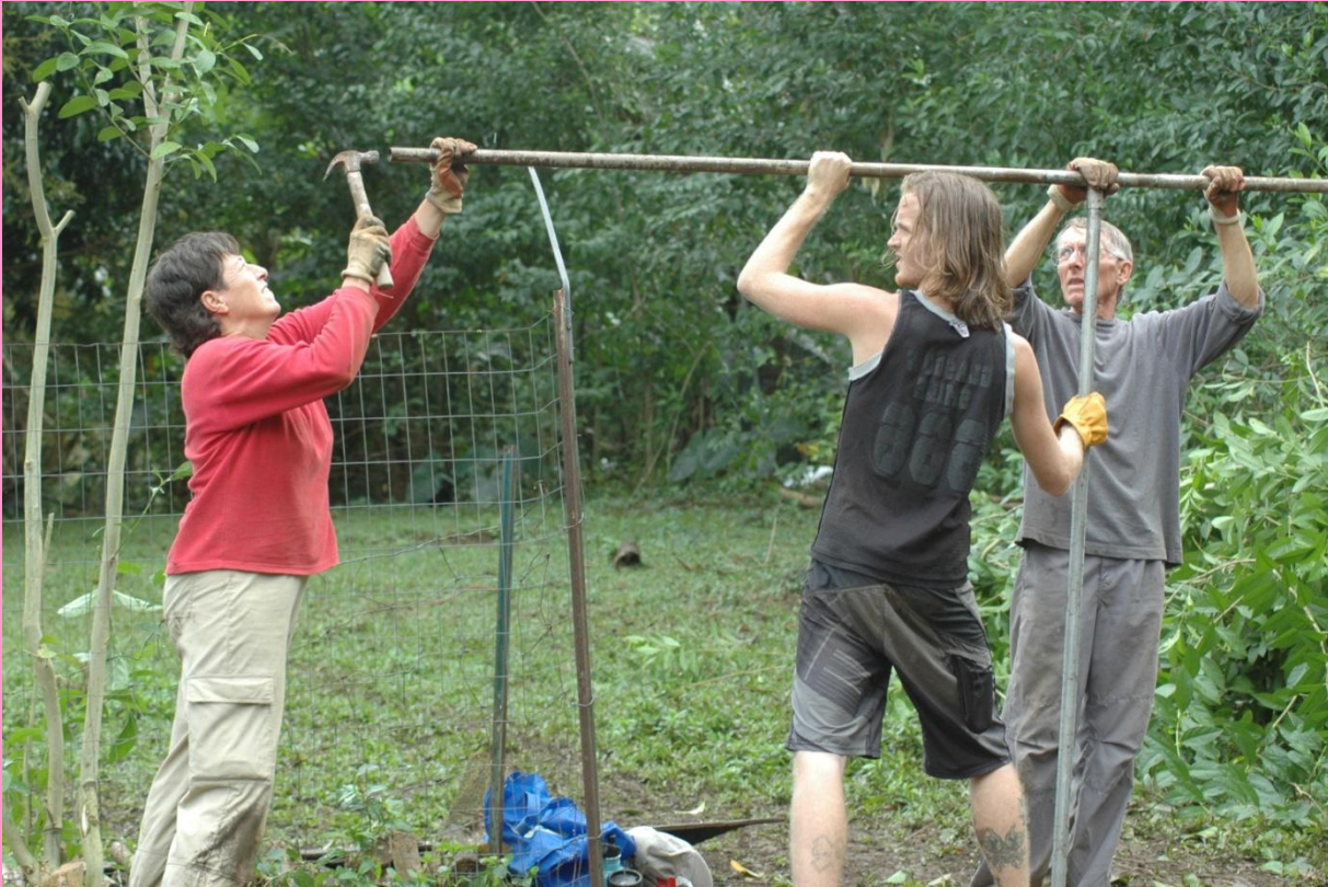
Volunteers assemble frame for new special-needs chicken aviary

Join us on Monday mornings at 9:00 a.m. to help out at the farm. Projects may include cleaning the barn, fund-raising, gardening, assisting with farm tours, spreading wood chips, animal grooming, handyman jobs, deck cleaning, tree trimming, manure collection, weed whacking, mulching, hoof trimming, window washing, cleaning rabbit pen, grass cutting, chain sawing, chipping, painting, carpentry, concrete work, trail maintenance, invasive plant removal, fence repair, and more. Your help will make a meaningful difference to the animals and visitors at Leilani Farm Sanctuary. Please email your RSVP to info@leilanifarmsanctuary.org